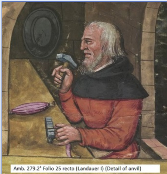
Amb. 279.2 o Folio 25 recto (Landauer I) (Detail of anvil)