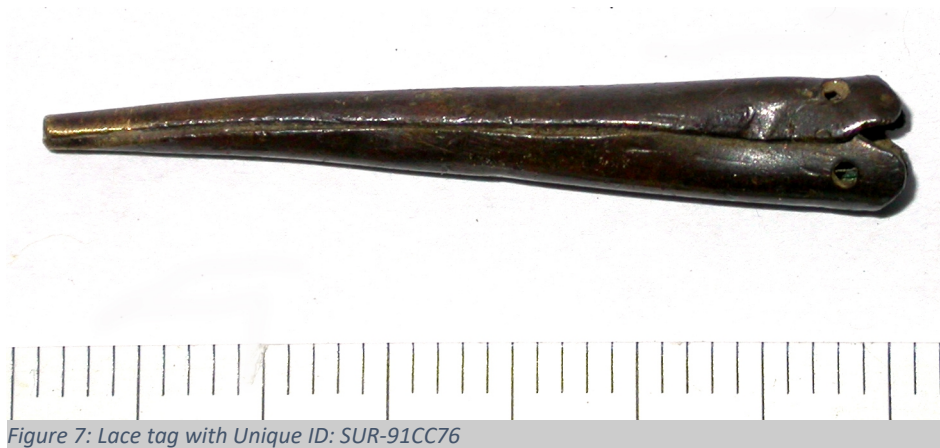
Figure 7: Lace tag with Unique ID: SUR-91CC76

This might be closer to a modern aiglet due to a possible date of manufacture from 1600 to 1800. 5