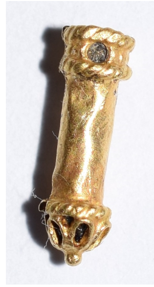
Figure 12: Gold aiglet 2.

As more information becomes available on this particular aiglet, it will be added to this paper.