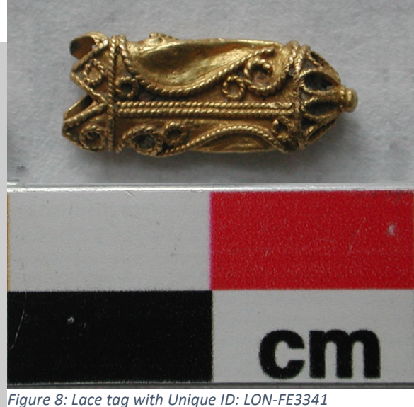
Figure 8: Lace tag with Unique ID: LON-FE3341

Dimensions: Length: 14.51mm; Width: 5.5mm; Thickness: 2.52mm; Weight: 0.7g. 6