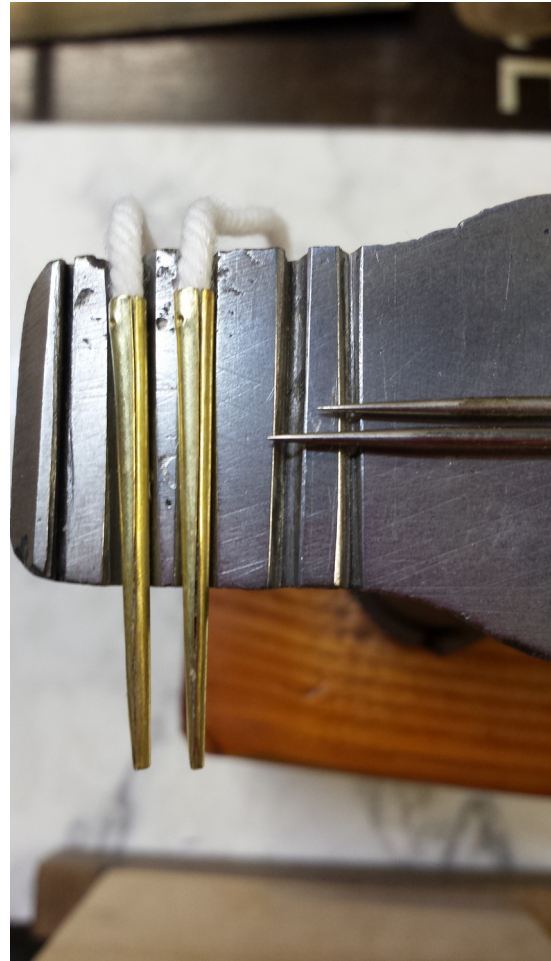
Figure 1: An assembled point ready to be riveted

After the type 1 aiglets are made, the cords are tipped with glue and inserted into the aiglets to dry. After drying for a day, they are placed on an anvil with grooves. A very fine, sharp punch is used to make a very small hole just smaller than the rivet wire on either side. This is where the dimples punched into the blanks help. They allow the hole to be made without the point rolling off of the aiglet.