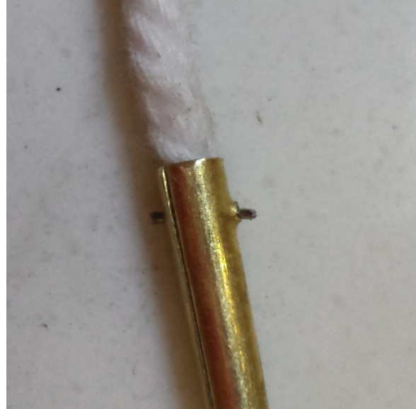
Figure 2: The iron wire inserted ready to be trimmed to length

A wire is carefully inserted and cut so it is slightly protruding on each side. The rivet is then placed on the table of the anvil and the peen is started with a very light, small steel hammer designed for riveting. The aiglet is turned so that the top and bottom of the rivet can start to deform into a mushroom shape that is wider than the holes in the aiglet.