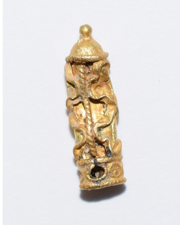
Figure 11: Gold aiglet 1.

As more information becomes available on this particular aiglet, it will be added to this paper.