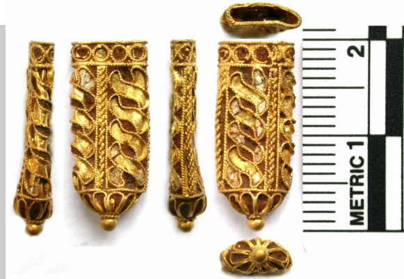
Figure 9: Lace tag with Unique ID: BUC-E33633

These would have been filled with coloured enamels of which only the white survives. The mouth of the aiglet has a border of nine small circles around it. Below that are rectangular panels, three containing S shapes rope-wise, which have traces of white enamel. These alternate with three panels filled by a rope pattern, made by twisting the twisted cloison wire. The domed end is bordered by a strand of twisted wire and has a ten petalled flower with a circle of twisted wire around a ball knob. All the background enamel has gone so the writer can only speculate about whether the aiglet was colourful or all gold and white. 7