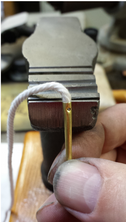
Figure 5: The finished rivet

You can clearly see the bottom side of the rivet, where it was against the anvil, has come through the brass, has mushroomed, and the brass itself is tight against the rivet.