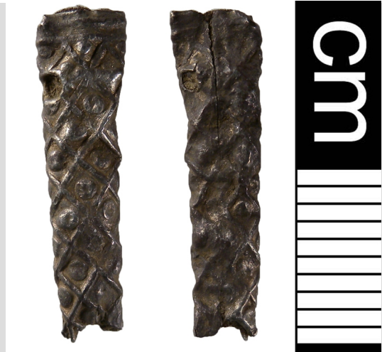
Figure 6: Lace tag with Unique ID: NMS-F13D26

Incomplete silver lace tag or aglet made from butt-jointed sheet forming a tube and decorated with a repoussé lattice with a pellet in the centre of each lozengiform cell, and two transverse ribs at the upper edge, below which are two empty circular holes. Tapering slightly towards the lower edge which is broken raggedy, and now squashed almost flat. The tag may contain the remains of decayed leather, just visible at one end. Surviving length 19mm. Maximum width 5mm. Weight 0.3g. 4