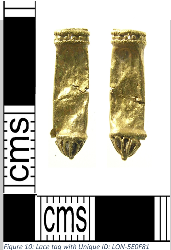
Figure 10: Lace tag with Unique ID: LON-5E0F81

Dimensions: length: 14.76mm; width: 5.76mm; weight: 0.54g. 8