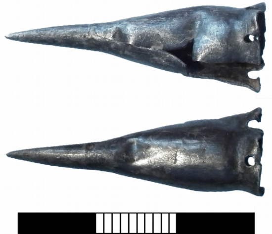
Figure 13: Lace tag with Unique ID: SUR-754F8E

There remains a possibility that this object is a silver cockspur. 11